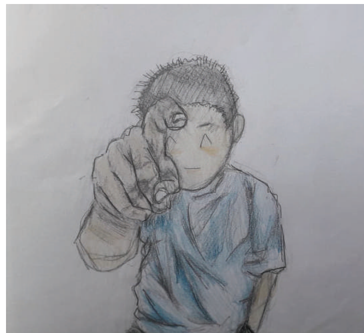
Foreshortening by: Tanya Hsiao