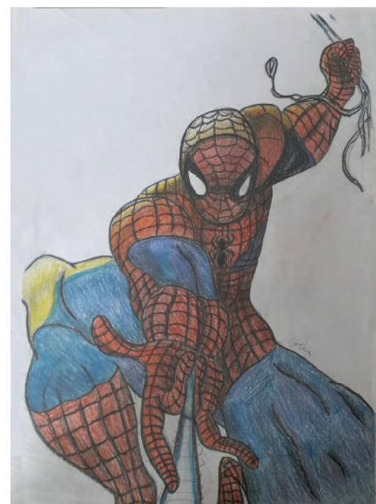
Foreshortening by: Cynthia Chang