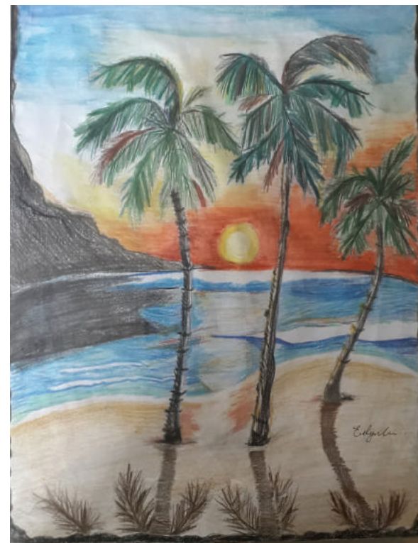
Tropical Sunset by: Evelyn Kuo